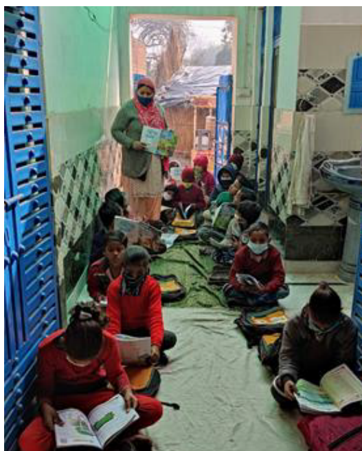
TEACHING WORK THROUGH CHAUPAL PATHSHALA