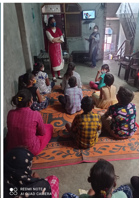
DOORDARSHAN PROGRAMME AND 42% STUDENTS WERE BENEFITTED.