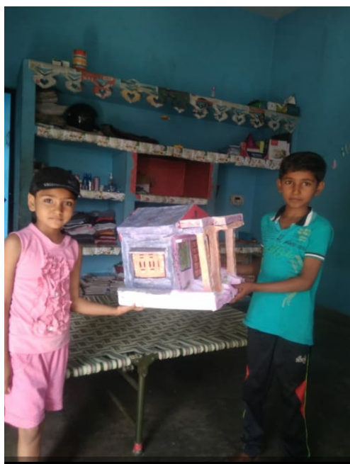
STUDENTS WERE APPRISED ABOUT DOORDARSHAN PROGRAMME AND 42% STUDENTS WERE BENEFITTED.